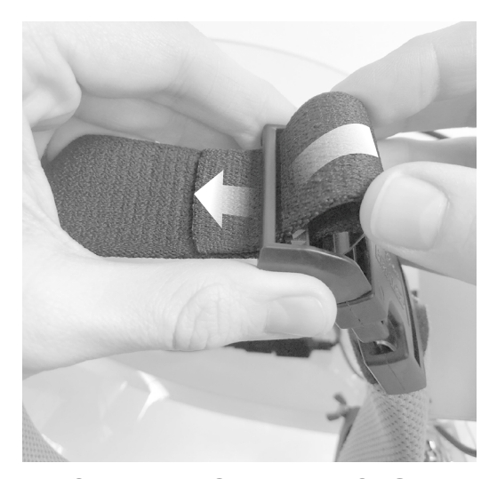
3. THREAD STRAP THROUGH SLOT WITH TEETH