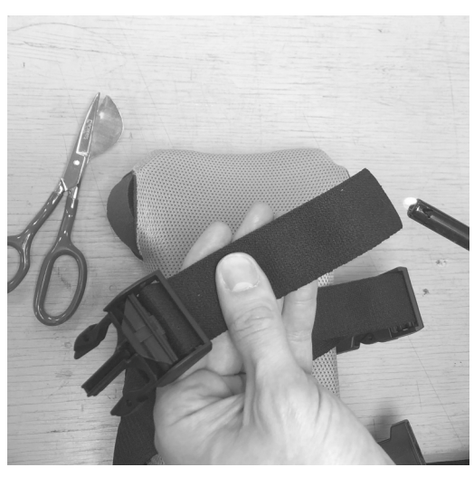
4. CUT EXCESS STRAP LENGTH & LEAVE 3" TIP: SINGE CUT END WITH