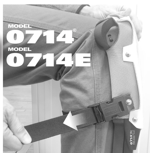
2. CLICK IN & PULL STRAP TO TIGHTEN & ACHIEVE DERSIRED FIT